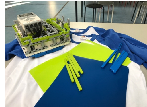
Our robot and shirts match!