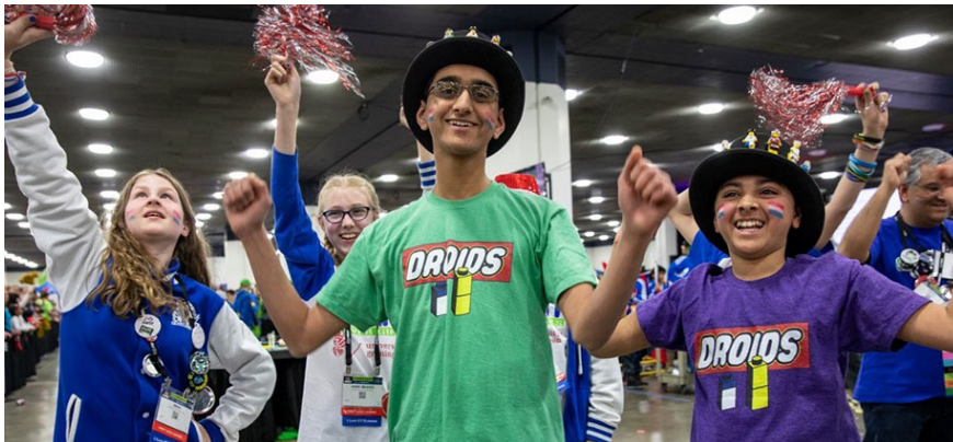
Pretty Smart supporting the Droids at 2018 Detroit World Festival