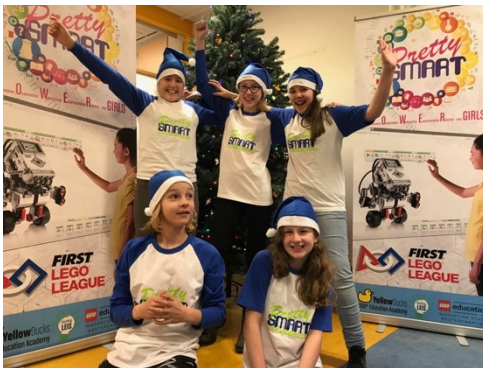
Christmas hats in december