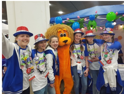
Dutch hats, makeup and ribbons for internationals